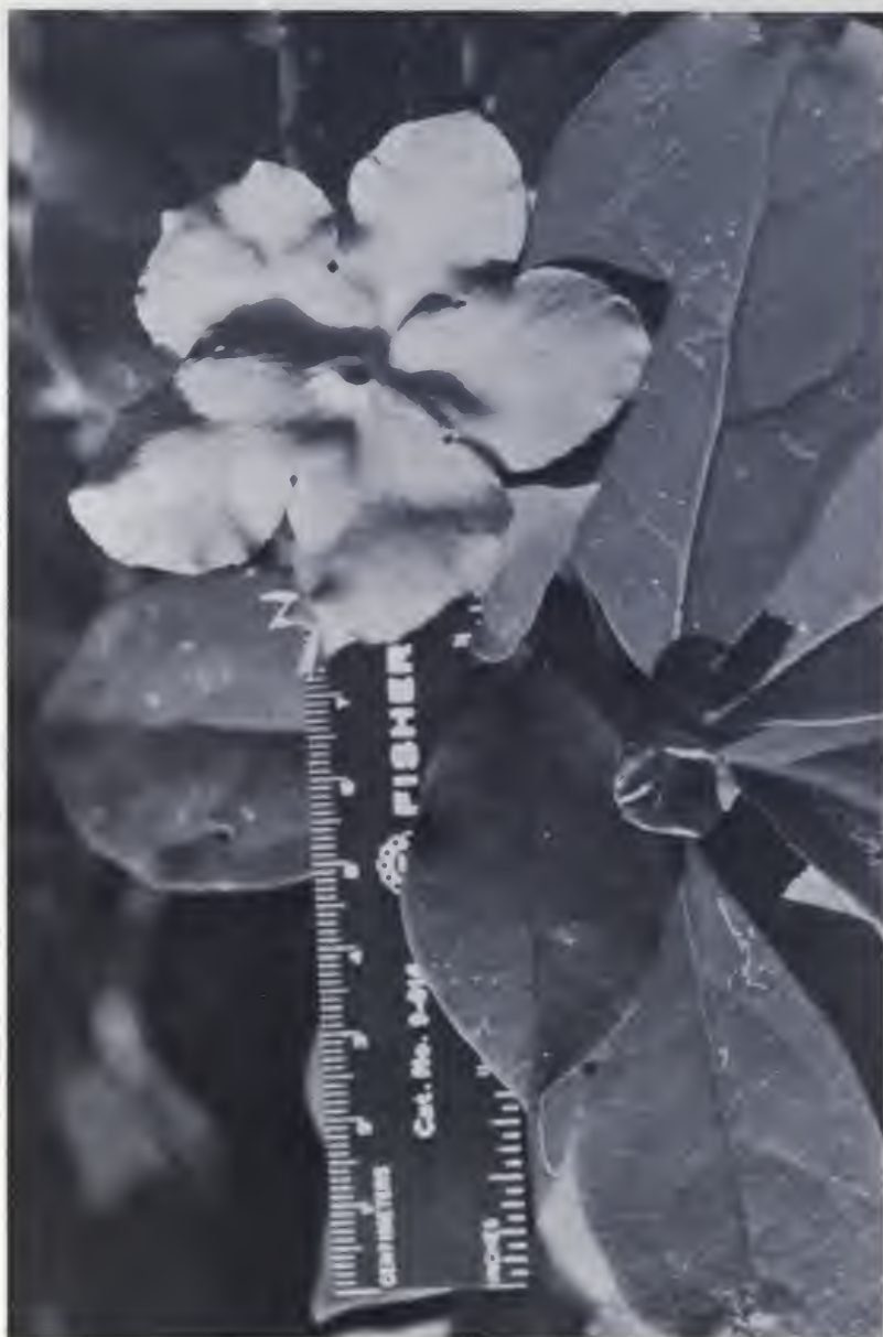
FIG. 2. Brunfelsia imatacana Plowman. Photograph of flowering branch. (From Plowman 1918.)